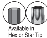
Available in Hex or Star Tip