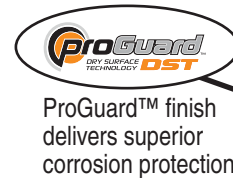
ProGuard™ finish delivers superior corrosion protection