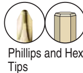
Phillips and Hex Tips