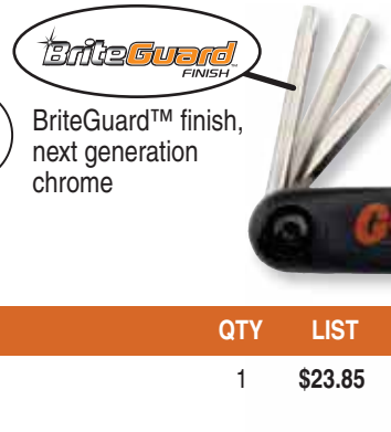
BriteGuard™ finish, next generation chrome

*Harley Davidson® is a Registered Trademark of Harley Davidson Motorcycles