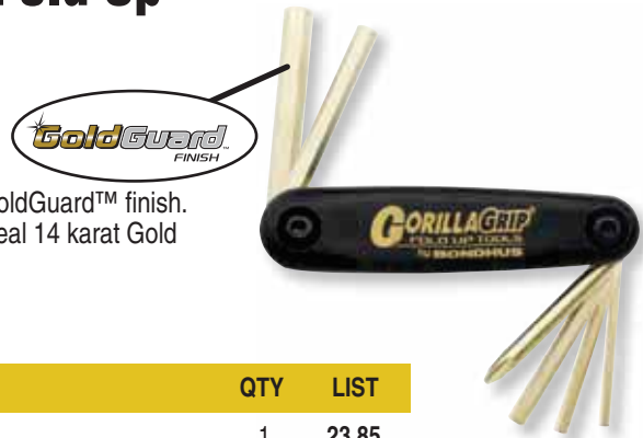
GoldGuard™ finish. Real 14 karat Gold